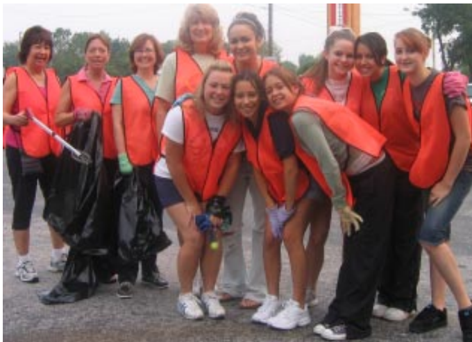
TT Juniors and Juniorettes get together twice a year to help clean up their Adopt-A-Highway project, 56th Street.