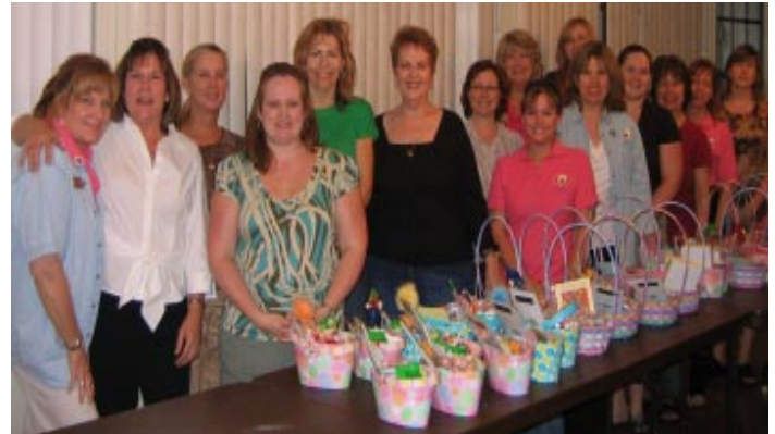
Temple Terrace Juniors made Easter baskets with toiletries, pads, candies and cards for residents at Hope Lodge.