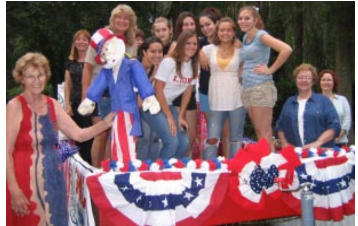
Members of the Temple Terrace Junior Woman's Club, the Woman's Club and Juniorettes teamed up to help with the float for the 4th of July Parade.