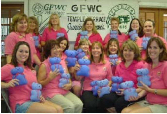
Juniors made Blue Bears for FFWC Fall Board and our local Fire Department.

GFWC TEMPLE TERRACE JUNIOR WOMAN'S CLUB P.O. Box 16206 Temple Terrace, FL 33687 www.ttjuniors.org (813) 989-9566 ...The Heart of Caring