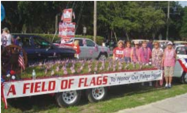
Members of the GFWC Temple Terrace Woman's Club, Juniors and Juniorettes joined together to decorate their float and participate in the city's 4th of July Parade.