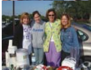
Juniors at the Relay for Life Yard Sale.